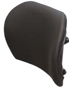
MATRIX-PB ELITE 12" H