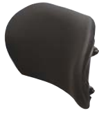
MATRIX-PB ELITE SHORT 10" H