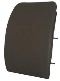
MATRIX-PB ELITE FULL 20" H