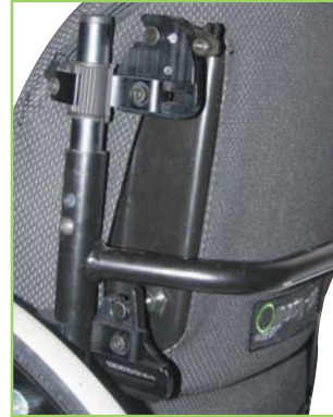
Split Mounting Hardware (SMH)