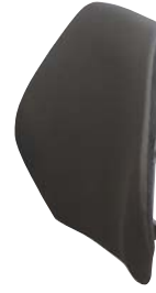
MATRIX-PB ELITE 20" H