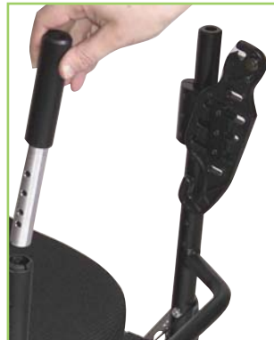
Posture Back Cane Replacement