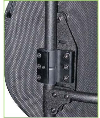
Fixed Space Saver Mounting Hardware (FSSH)