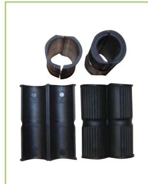
Posture Back Cane Clamp Inserts