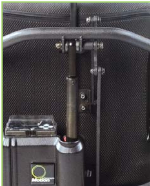
Extended Shear Reduction Mounting Hardware