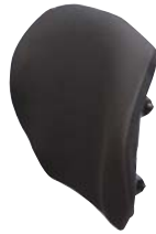
MATRIX-PB ELITE 16" H