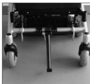
Curb climbing assist