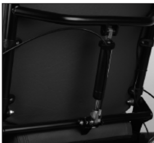
Mechanical back angle adjustment