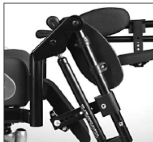
Mechanically elevating footrest