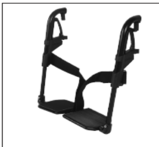
Individual footrests with aluminium footplates