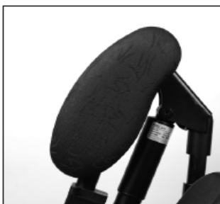
Lateral leg pad