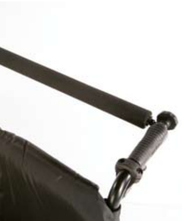
Back stabilizer, increases overall stability and can be swung out of the way for folding