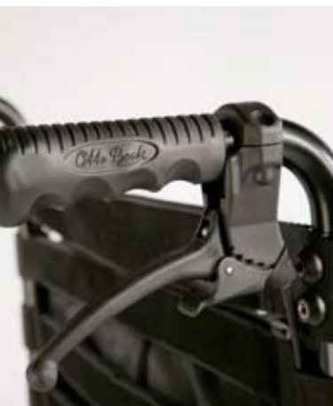
Brake lever for attendant