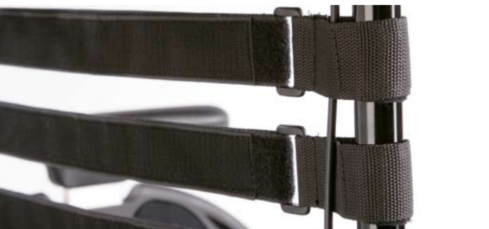
Adaptable back upholstery, adjustable without the use of tools