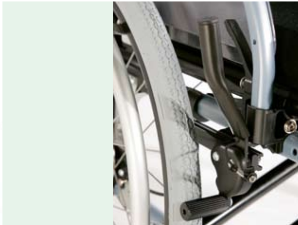
The wheel lock lever extension enables users with limited hand strength to use the wheel lock