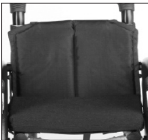
MC 01 Seat cushion