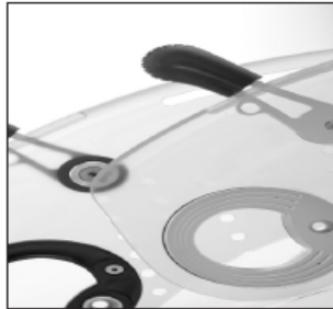
ME 10 Design clothing protector