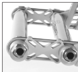
MG 85 Wheelbase extension