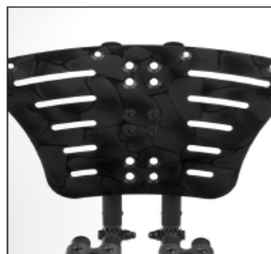
MB 04 Footplate; different angle settings possible