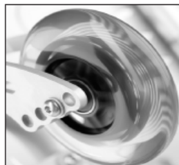
MF 21 Luminous wheel