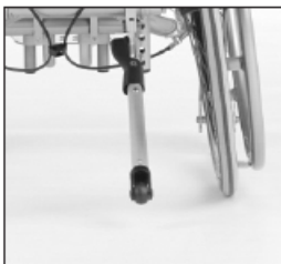
MA 55 Anti-tipper

On each side of the wheelchair, only one option (anti-tipper, crutch holder, or tip-assist) can be mounted.