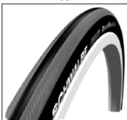
MG 39 Schwalbe RightRun light