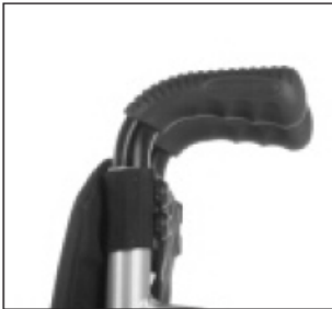
MD 50 Push handles, short, fixed