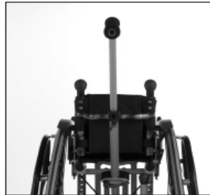
MD 57 Pushbar