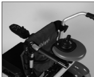
Control for attendant