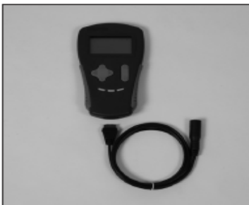
Hand programming device