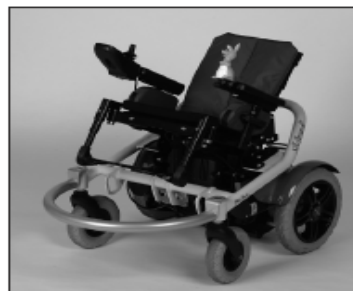
Electric seat tilt