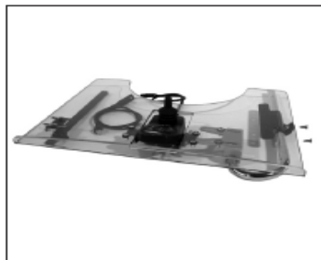
Tray with integrated mid-tray control