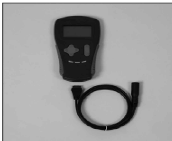
Hand programming device