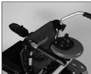
Control for attendant