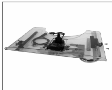
Tray with integrated mid-tray control