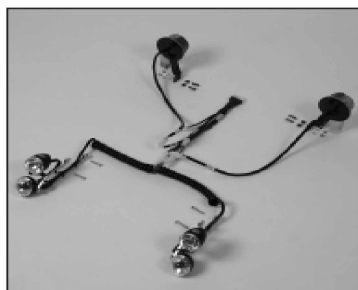
Lighting according to German Motor Vehicle Safety Standards (StVZO)