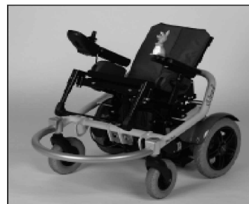
Electric seat tilt