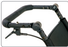
Adjustable push bar option