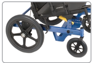
Variety of caster and wheel sizes

Seat width, standard 14" – 22" Seat width, custom 23" – 32" Seat depth (adjustable) 16" – 22" Seat height (adjustable) 14" – 20" Back angle (adjustable) 90° – 120° Back height (adjustable) 18" – 26" Dynamic tilt 45°