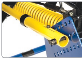
Actuator adjusts for optimal use