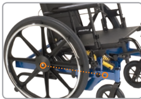
Easily adjustable axle position