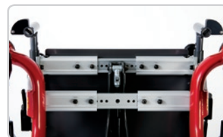
Adjustable chair width

Seat width (adjustable) 13" – 20" Seat depth (adjustable) 15" – 20" Seat height (adjustable) 13" – 20" Back angle (adjustable) 90° – 120° Back height 20", 25" Dynamic tilt -5° to 20°