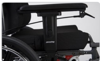
Available with self tilt option