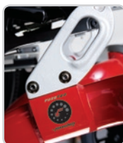
Optional transit tie-downs