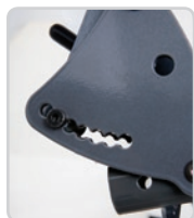
Adjustable back angle

TREND-SETTING FRAME COLORS. YOU CAN ORDER CUSTOM COLORS TOO. CONTACT US FOR DETAILS.